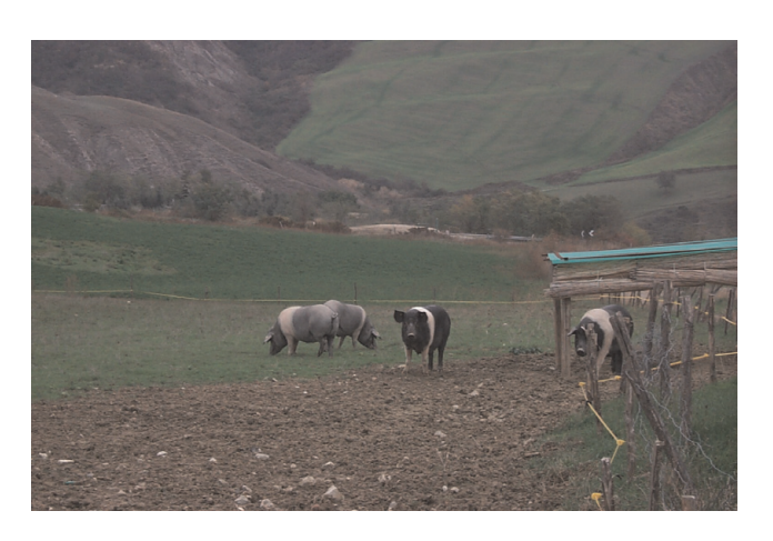
Figure 3. Cinta Senese boar.