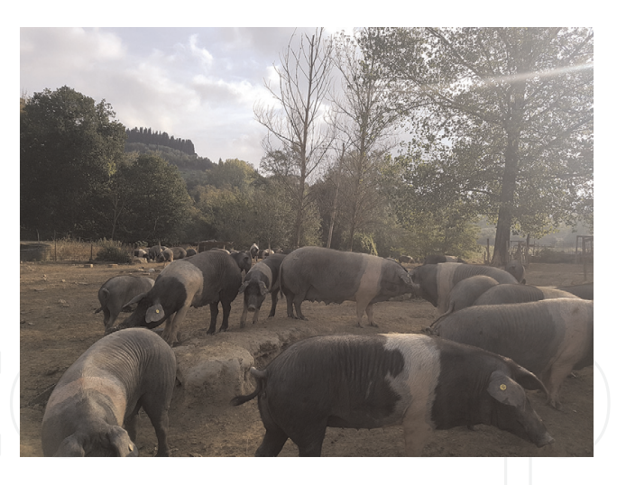
Figure 2. Cinta Senese sow with piglets.